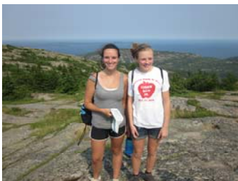
At the top of Acadia

There were many experiences that came from this that weren't just work. Some of the best highlights of the day were moments of bonding with the community and our fellow conferees. We laughed A LOT and shared many good, scratch that, great times like making dinner together, playing Twister, climbing Mt. Cadillac and Acadia, having campfires, and looking at the stars. There were many individual moments spent with each other. We wouldn't trade a single moment for any moment for anything. Thank you to everyone that prayed for us while we were out of our comfort zone and thank you to the church for introducing Silver Lake Conference Center to us. We are already looking forward to next year's trip.